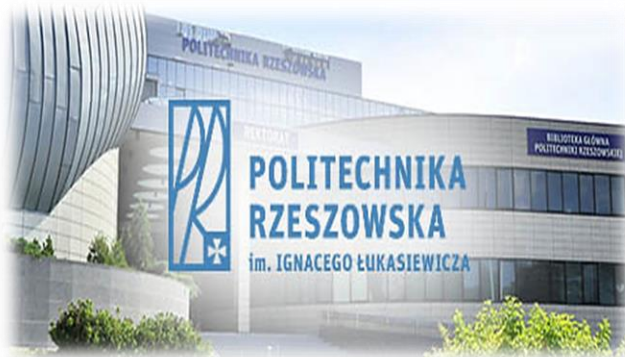
Rzeszow Polytechnic University, Poland