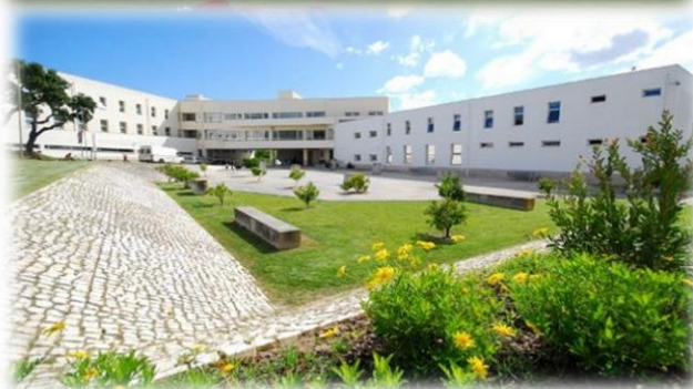
Polytechnic Institute of Setubal Portugal